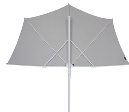
Sun Wave 270x150 cm Olympos white Mellow Silver