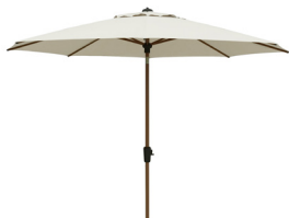
Lissabon teak 300/8 cm Mellow champagne