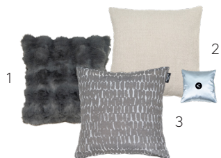
1. Bobbie grey 2. Elle natural 3. Lilly grey