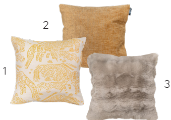
1. Jacky gold 2. Pippa gold 3. Bobbie beige